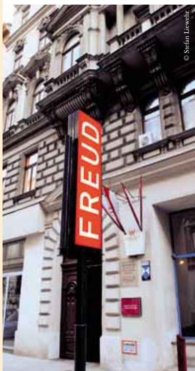
Sigmund Freud Museum ▲

The restaurant, which is situated in the center of the capital of Serbia, has been named after the Russian czar Alexander II and even today is a symbol of Russian-Serbian friendship. Next to the restaurant the building, which has been totally refurbished, now houses also a bakery and a multiple use hall. And of course a modern restaurant also needs reliable fire protection. Therefore it is none too surprising that the owners of "Ruski car" have put their trust in Schrack Seconet. With the installation of the modular fire-alarm panel Integral the guests