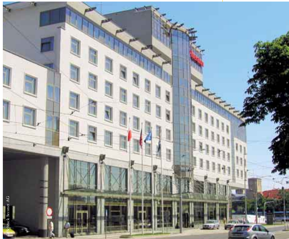
Schrack Seconet AG