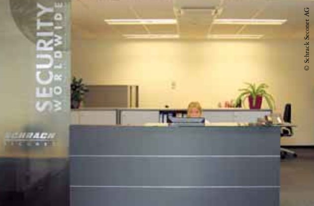
▲ Lobby of the branch office Linz