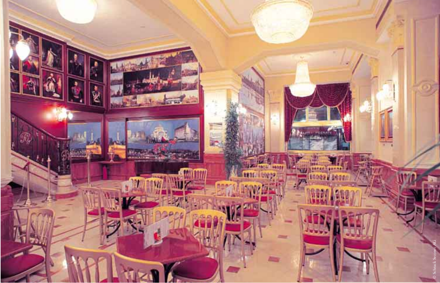
▲ Belgrade cult restaurant "Ruski car"